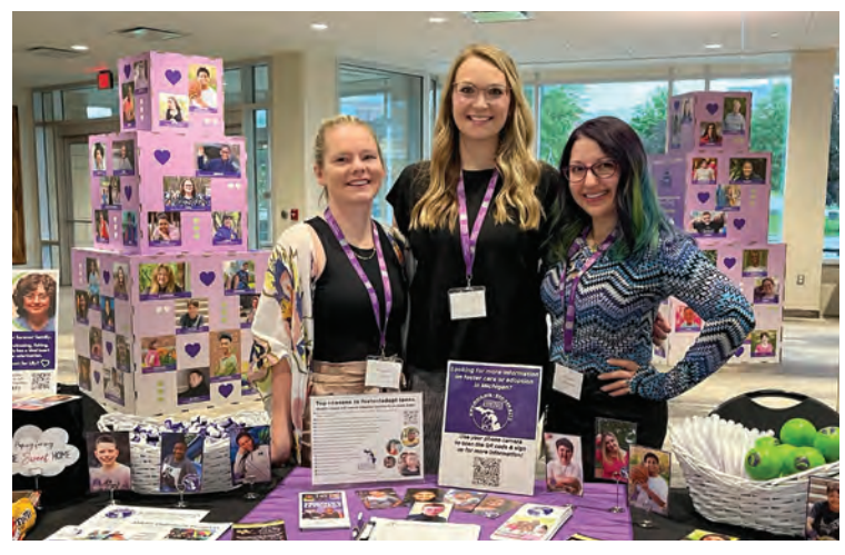
Match Support Specialists: Supporting families after they're matched with a child.

Match Support is a statewide service available to you once you're matched with a child from the MARE website and are proceeding with adoption. Program specialists tailor their services to your unique needs, goals, and interests. While specialists have the flexibility to assist in several ways, families' top requests often include: